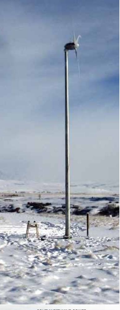
SOUTHWEST WIND POWER

"The investment to hook your technology into our system is as low as its likely going to get."